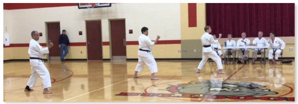
Mid-America Karate-ka taking a Dan exam at our December 2017 regional training