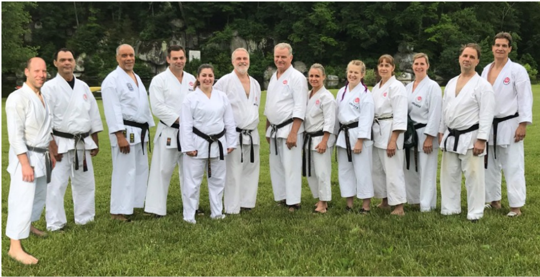
Mid-America Karate-ka at Master Camp 2018

some of the best karate-ka in the world. In every training I benefited from the chance to do partner work with other people. And as Camp went on we all developed the kind of camaraderie that comes from a group of dedicated people all working together to achieve a goal.