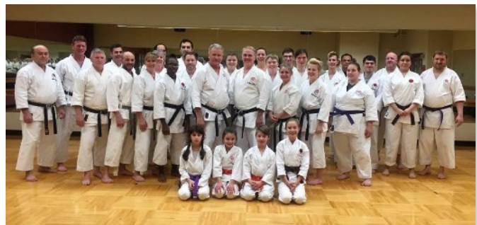
Mid-America students attend Kangeiko 2017