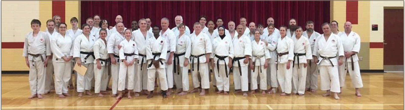
Mid-America Karateka at the March Regional Training in West Milton, OH