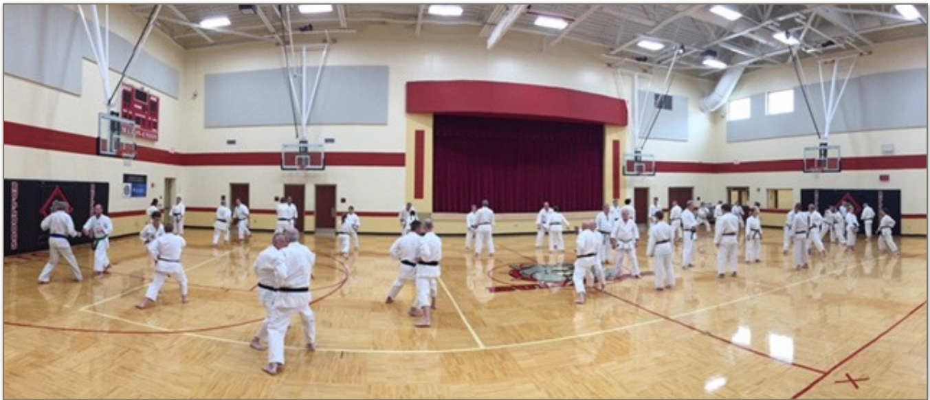
Students attend training hosted by the Dayton Shotokan Karate Club